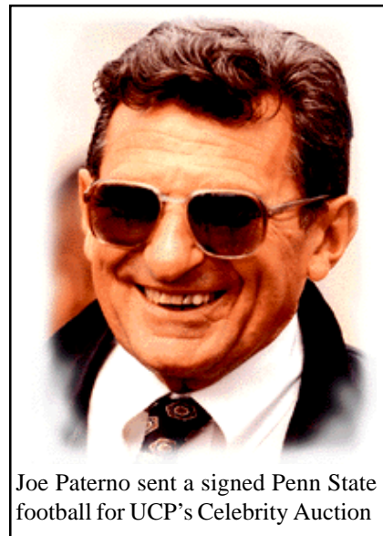
Joe Paterno sent a signed Penn State football for UCP's Celebrity Auction

All proceeds from the Celebrity Auction will benefit UCP's services for infants, children and adults with disabilities in South Central PA.