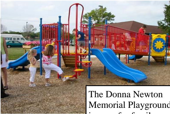
The Donna Newton Memorial Playground is open for family use.

Any child with a disability is eligible to participate in Children's Services. While there is a fee to participate in some programs, no child is denied due to a family's inability to pay.