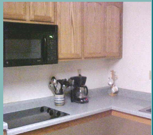
(Left to Right) Group Home kitchen before the remodel; after the remodel.