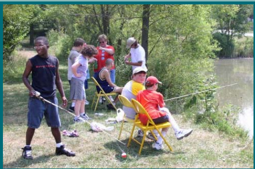
(Above) Day campers and staff pose for a picture at the Decatur Zoo; (Below) Campers fish at Rock Springs Conservation Center.