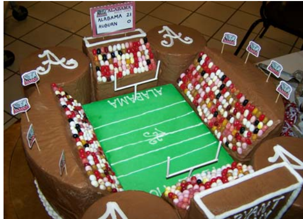
From “Best of Show” Mary’s Cakes & Pastries

The 2006 “Taste of the Town” event benefiting United Cerebral Palsy of West Alabama was held at Shelton State Community College on August 15 and was a huge success. Several local restaurants and caterers brought their signature dishes for participants to sample. Everything from hot wings to seafood gumbo to artichoke dip was offered. The desserts were as beautiful as they were tasty. The Alabama football stadium cake, designed by Mary’s Cakes & Pastries , was a crowd pleaser and won the prize for ‘ Best of Show. ’ Local vendors set up booths to show their wares and local candidates running for political office were available for participants to engage in a friendly political discussion. A silent auction, also held during “Taste of the Town” each year, helped to raise funds for a worthy cause. Several businesses and