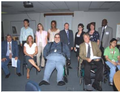
Recognition of the program at IDOT

UCP began a job training site for students and recent graduates with disabilities two years ago at the Illinois Department of Transportation (IDOT). The “Student Professionals with Disabilities” program started in the IDOT cafeteria and soon grew to other departments within the agency. The program continues to flourish as students began training in eight more departments this year including District 6, District 4, the Bureau of Aeronautics, Bureau of Civil Rights, Bureau of Bridges and Structures, the Bureau of Budget and Accounting, the Office of Labor Relations, and the Bureau of Computer Services.