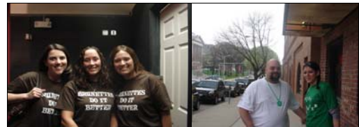
Top Row - 1st: “Brunettes do it better”, 2nd: Golfers outside D.H. Brown’s